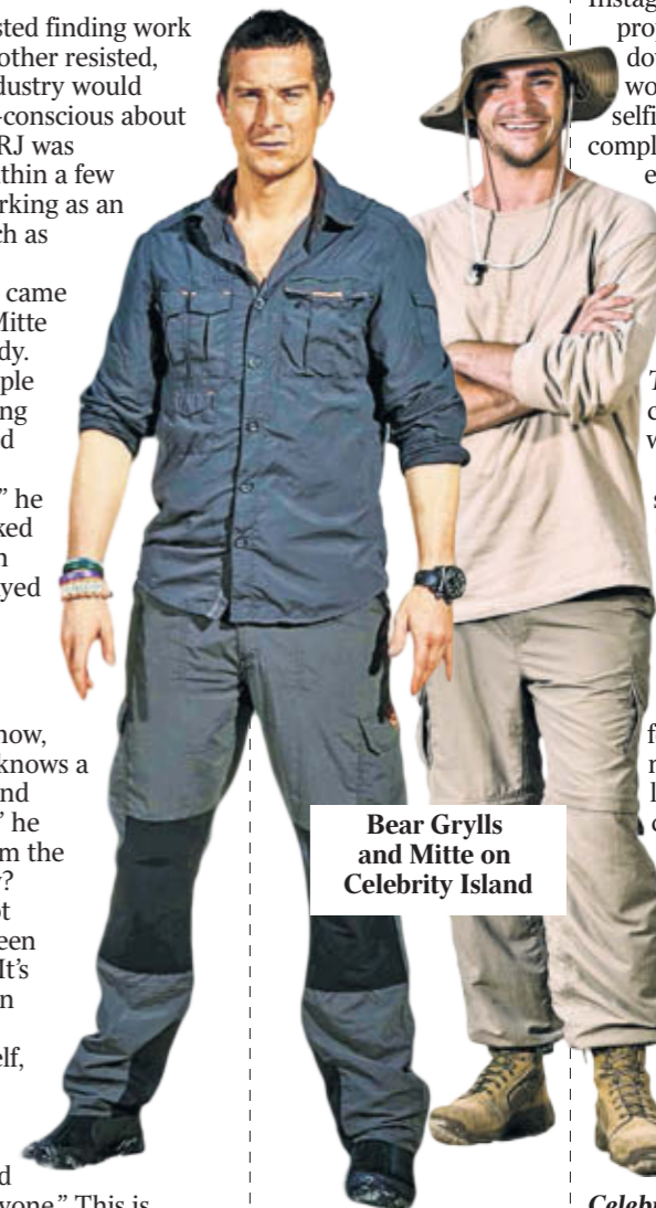
Bear Grylls and Mitte on Celebrity Island

Celebrity Island with Bear Grylls starts on August 29 on Channel 4